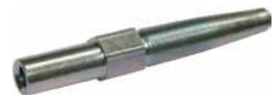
Hose Stud Straight