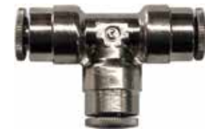
Tee Piece Push-In Type With Knurled Collar for Plastic Tube