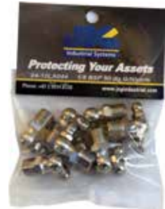
Grease Nipples - Pack of 10