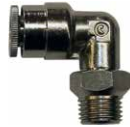
Elbow 90° Push-In Type With Knurled Collar for Plastic Tube