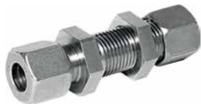
Straight Bulkhead Fitting