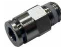
Male Connector Push-In Type With Reinforced Collar for High Pressure Hose Stud