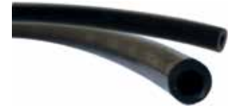
Pressure Plastic Tube