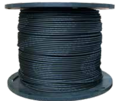
High Pressure Plastic Hose - 600m Roll