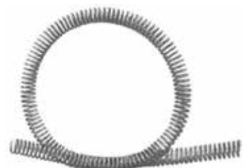
Spring Coil Stainless Steel (1.4310)