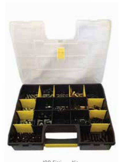
JSG Fittings Kit