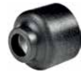
Protecting Cap for 6mm Push-In Type Fittings