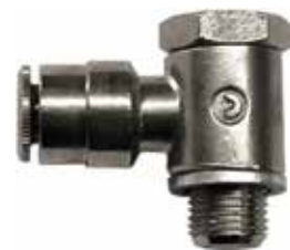
Banjo Connector Push-In Type With Knurled Collar for Plastic Tube