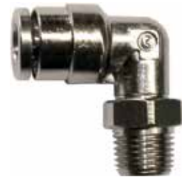
Elbow 90° Push-In Type With Reinforced Collar for High Pressure Hose Stud