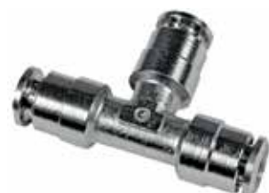
Tee Piece Push-In Type With Reinforced Collar for High Pressure Hose Stud