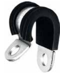
Tube Clamp with Rubber Lining