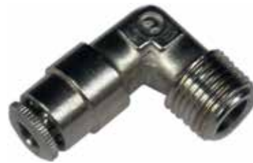
Elbow 90° Push-In Type With Knurled Collar for Plastic Tube