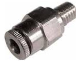
Male Connector Push-In Type With Knurled Collar for Plastic Tube