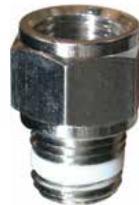
Relief Valve Adaptor