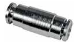
Line Connector Union Push-In Type With Reinforced Collar for Hose Stud