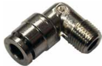
Elbow 90° Push-In Type With Reinforced Collar for High Pressure Hose Stud