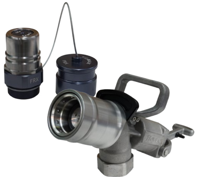
53-FX1500-P and 53-FRX-C