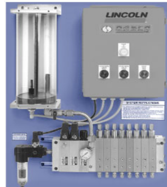
Standard System Series 170 Typ 170

Please inquire about custom tailored lubrication systems (Series 200 & 300) with more than 16 injector pumps, and/or customer specific controllers, or with additional monitoring functions. We will design a system to your specifications.