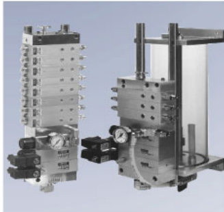
Pump Series VS, Without Reservoir Pump Series VSR, 4L Oil Reservoir

Depending on the injector version and the cycle frequency, either an ultra-fine or a thicker oil film is applied.