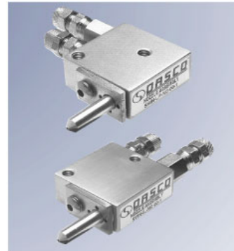
Spray Nozzle - SWN LP, Side Connections Spray Nozzle - SWN IP, Back Connections

The list of equipment for each module can be individually configured from standard components. Please ask us for further details.